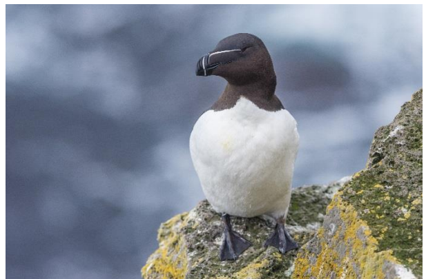
From top: White-tailed Eagle, Crested Tit & Razorbill.